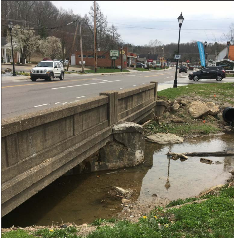
Existing Structure - Note the Deterioration on the Pier

The existing Richland Avenue Bridge is located near 362 Richland Avenue. The bridge was constructed over Coates Run in 1935, and is a two-span reinforced concrete slab, currently rated at 65% of Ohio Legal Loads.